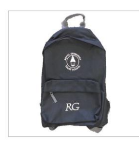
.RGT School Bag + Initials