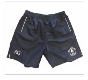
.RGT School P.E Shorts + Initials