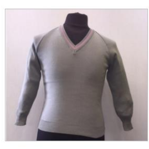
..RGT School Jumper