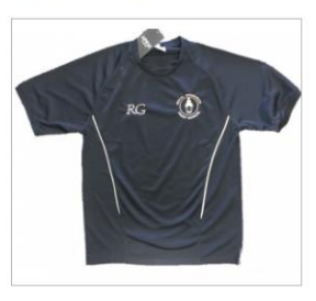
.RGT School P.E T-Shirt + Initials