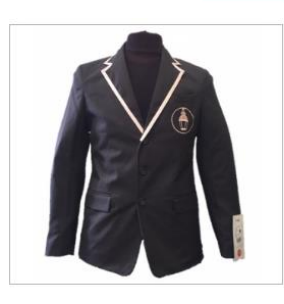
RGT Boys School Blazer