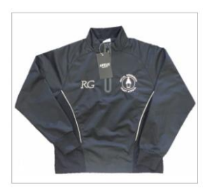
.RGT P.E Outdoor Top + Initials