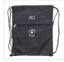
.RGT P.E Bag + Initials